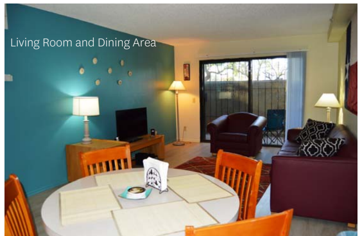
Living Room and Dining Area

* Information, including rents, is accurate as of the time of publication. The availability of listed housing accommodations and programs are subject to change based on local health authority restrictions and guidelines.